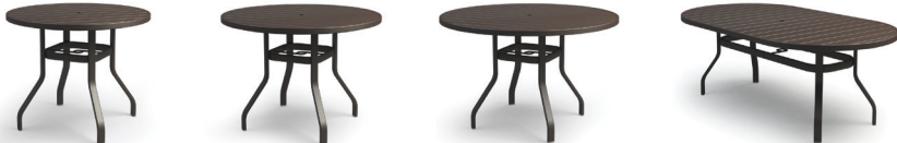
42" BAR 3042RBR (with Hole) H: 40" 48" BAR 3048RBR (with Hole) H: 40" 54" BAR 3054RBR (with Hole) H: 40" 42" x 82" BAR 304482BR (with Hole) H: 40"