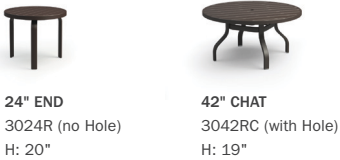
24" END 3024R (no Hole) H: 20" 42" CHAT 3042RC (with Hole) H: 19"