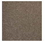
WEATHERED WOOD (25)